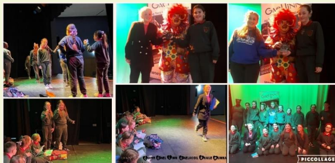
Coim. Gael Linn - 8 ú Márta